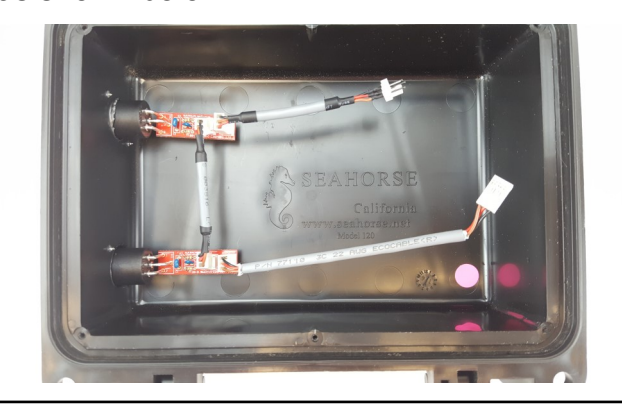
Step 7) Connect cables to XLR connectors as shown below.