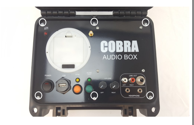
Step 1) Remove the six screws from the front of the Audio Box faceplate. Then, remove the Audio Box from the armored case.

Step 2) On the left side of the armored case, measure and mark 1 3/8" from the left and right side of the case.