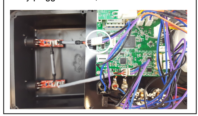
Step 9) Connect the cable that was previously plugged into J5, into male XLR cable.