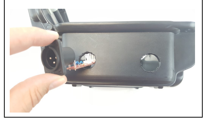
Step 5) Insert XLR board through hole in the side of the armored case.