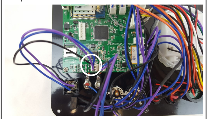
Step 8) Disconnect J5 cable (1/4" Jack Cable) from Audio Box.