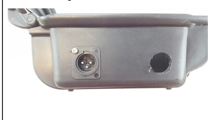
Step 6) Use drill to insert screws into top left and bottom right of each XLR connector.